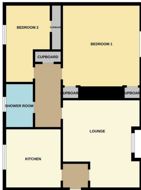
GROUND FLOOR 732 sq.ft. (68.0 sq.m.) approx.

TOTAL FLOOR AREA: 732 sq.ft. (68.0 sq.m.) approx. Whilst every attempt has been made to ensure the accuracy of the floorplan contained here, measurements of doors, windows, rooms and any other items are approximate and no responsibility is taken for any errors, omissions or mis-statements. This plan is for illustrative purposes only and should be used in conjunction with any prospective purchase. The services, systems and appliances shown have not been tested and no guarantee as to their operability or efficiency can be given. Made with Memphis 02025